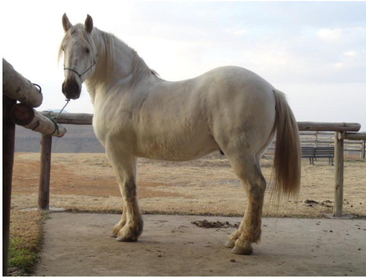
Waterford Dynamite the day before departing for his new home in Bloemfontein