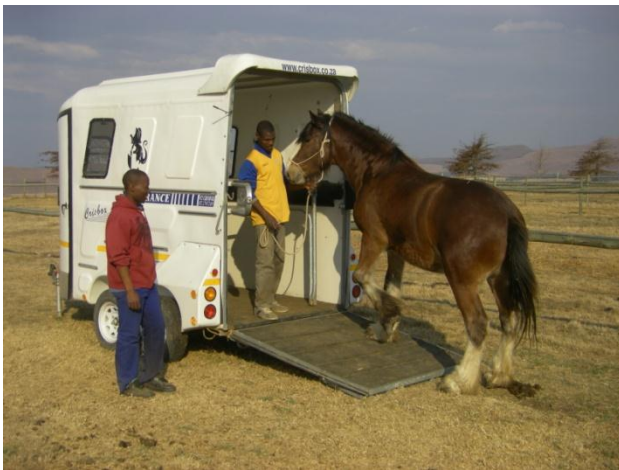
Waterford Clyde going happily into the box