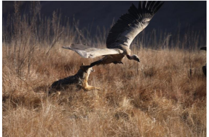
Jackal and Vultures often compete for food, here we see the Jackal chasing the Vulture away