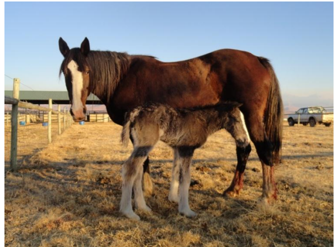
Shire filly born 26 July 2012