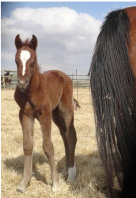
Arab colt born 23 July 2012

We have now finished weaning all our foals, and just in time for the new foals that are already starting to arrive! We have had two babies born this last week, a chestnut Arab colt and a black Shire X Thoroughbred filly, which both arrived safe and sound.