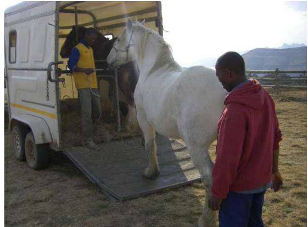
Dynamite following close behind