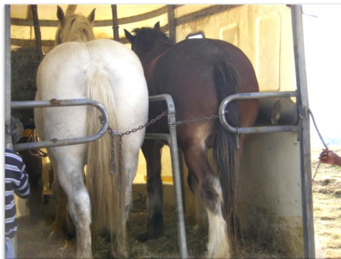
2 in a 3-berth horsebox – a bit of a tight squeeze but they're in!